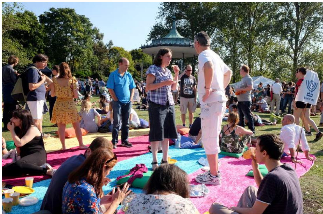
Klezmer in the Park