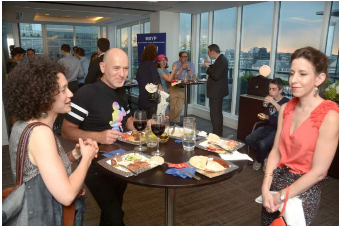
BBYP Israel Wine Tasting Photo Night