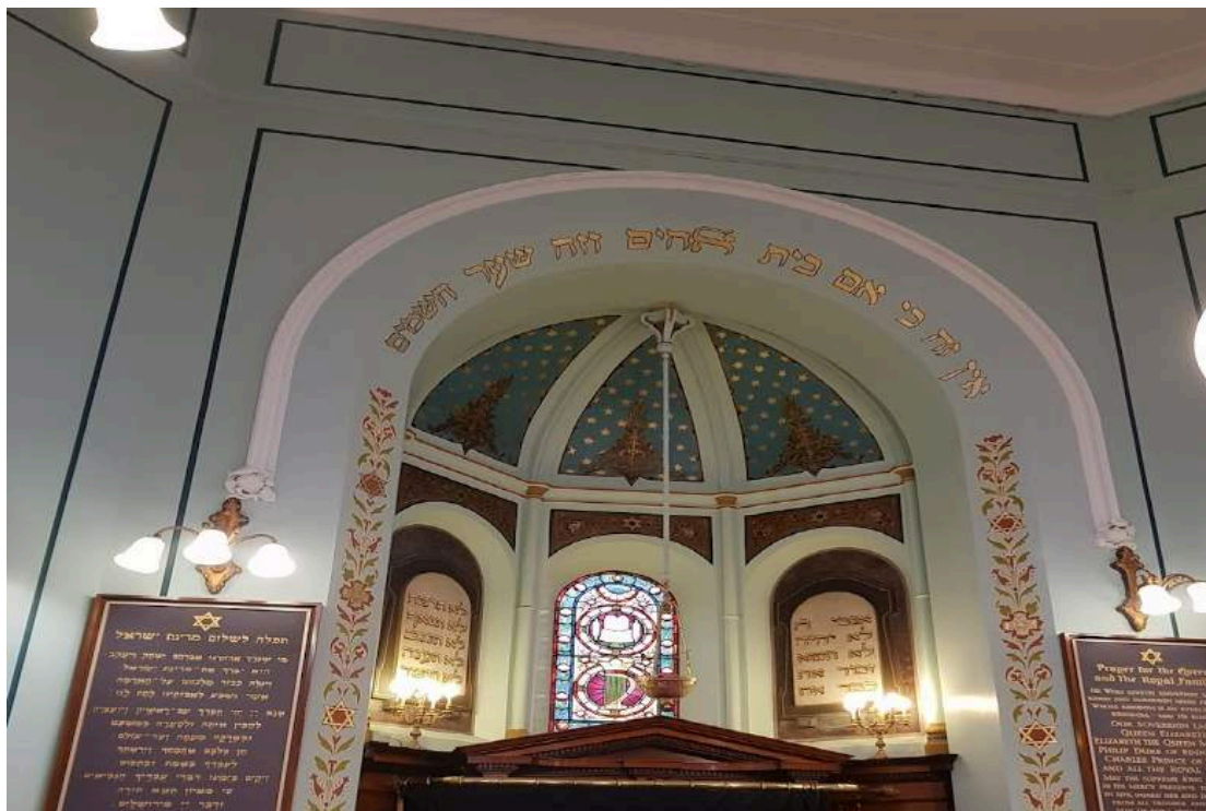
Leicester Hebrew Congregation, one of the participants in EDJCH 2018